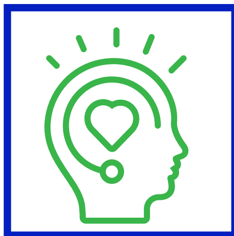
7. Adaptive Strategies