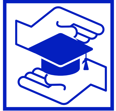
3. Guidance Alignment