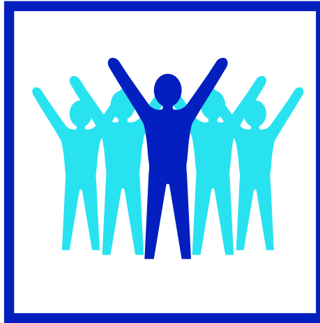
2. Inspiring Leadership