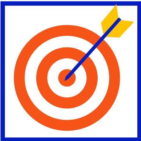
4. Curriculum Alignment