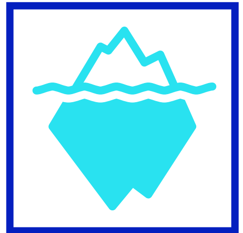
5. Nested Data Systems