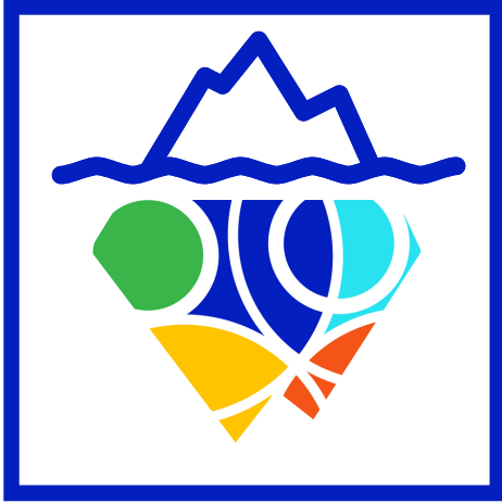
1. Equity Study